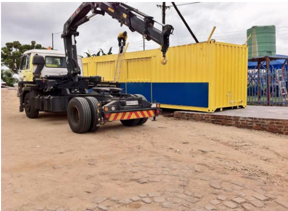
The butchery container being hoisted into position

On the 4 th December 2010, the Nkomazi Community Trust opened its first commercial butchery in the small village of Tonga, located in the heart of the Nkomazi valley in Mpumalanga.